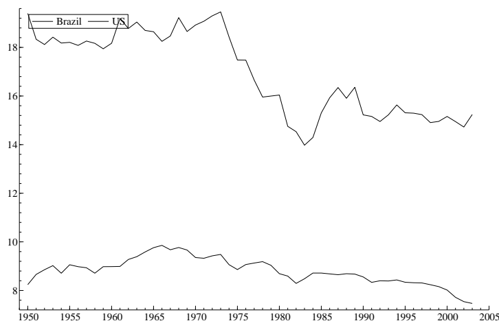
Graph 3: Marginal Product of Capital Author elaboration based on data from Heston et al. (2006)

the high inflation period. We have also estimated an AR(1) that passed all tests. The estimated constant is 5,47 (not significant) and the root, 0,508, is significant at 10%, hence \bar{r} = 10,76\% and \alpha = 0,30 .